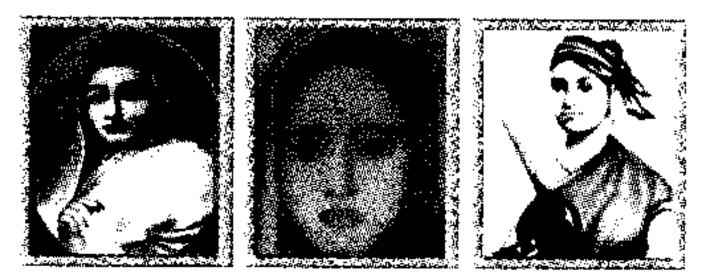
अहिल्याबाई होळकर फातिमा शेख राणी लक्ष्मीबाई

पंजीकरण संख्या 56/144/2012/रा0द0 अनु0- | Registration No. 56/144/2012/PPS-I.