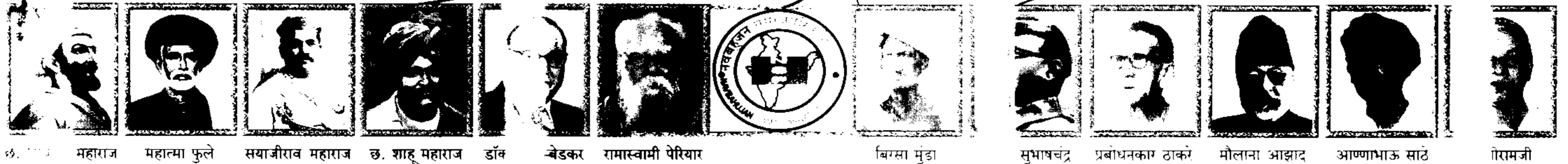
महाराज महान्या फुले सयाजीराव महाराज छ. शाह महाराज डॉ. बेडकर रामास्वामी पेरियार बिस्मा मुंडा सुभाषचंद्र प्रबोधनकाश ठाकरे मौलाना आझाद आण्णाभाऊ साठे गोरामजी