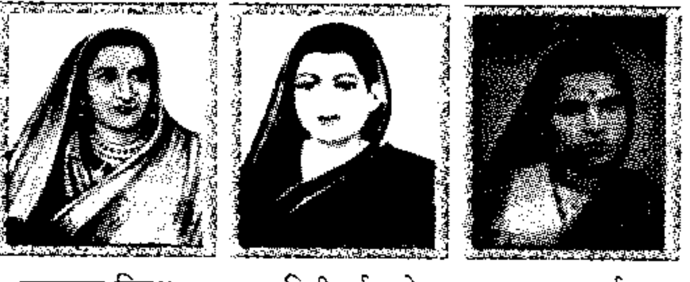
राजमाता जिजाऊ सावित्रीबाई फुले माता रमाई