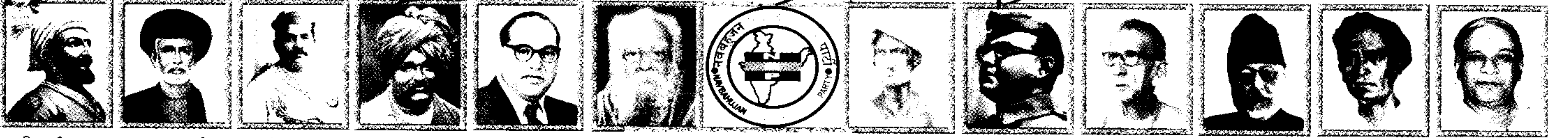
छ. शिवाजी महाराज महात्मा फुले सयाजीराव महाराज छ. शाहू महाराज डॉक्टर आम्बेडकर रामास्वामी पेरियार बिरसा मुंडा नेताजी सुभाषचंद्र प्रबोधनकार ठाकरे मौलाना आझाद आण्णाभाऊ साठे कांशीरामजी