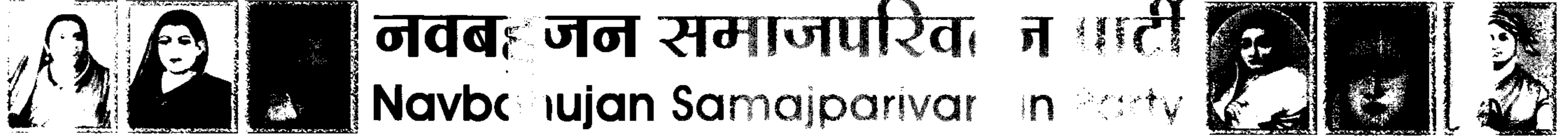
रा. वजाऊ सावित्रीबाई फुले माता रमाई पंजीकरण संख्या 144/2012/रा0द0 अनु0- | Registration No. 144/2012/PPS-I. अहिल्याबाई होळकर फातिमा शय्य लक्ष्मीबाई